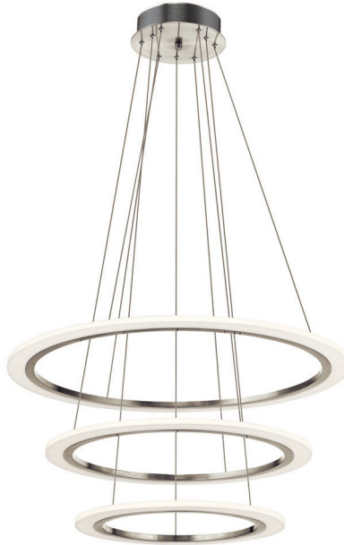
B | 83669