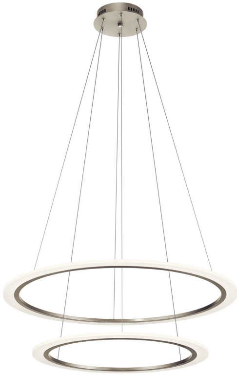
A | 83990