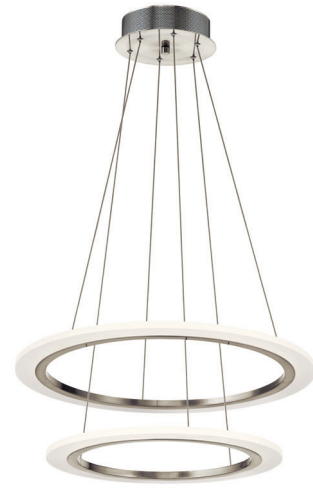
C | 83670